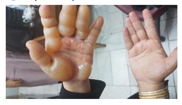
Figure 1: picture of mupirocin-induced contact dermatitis

Adverse Drug Reactions of mupirocin have been reported in some cases after topical administration. However, it is said that less than of mupirocin users have experienced temporary skin symptoms such as burning and pain, and fortunately, systemic side effects are rare (1). This article describes a new case report ( Figure 1 ) followed by a review to explore and summarize the literature to provide a useful standpoint for clinicians and pharmacists about mupirocin-induced adverse drug reactions.